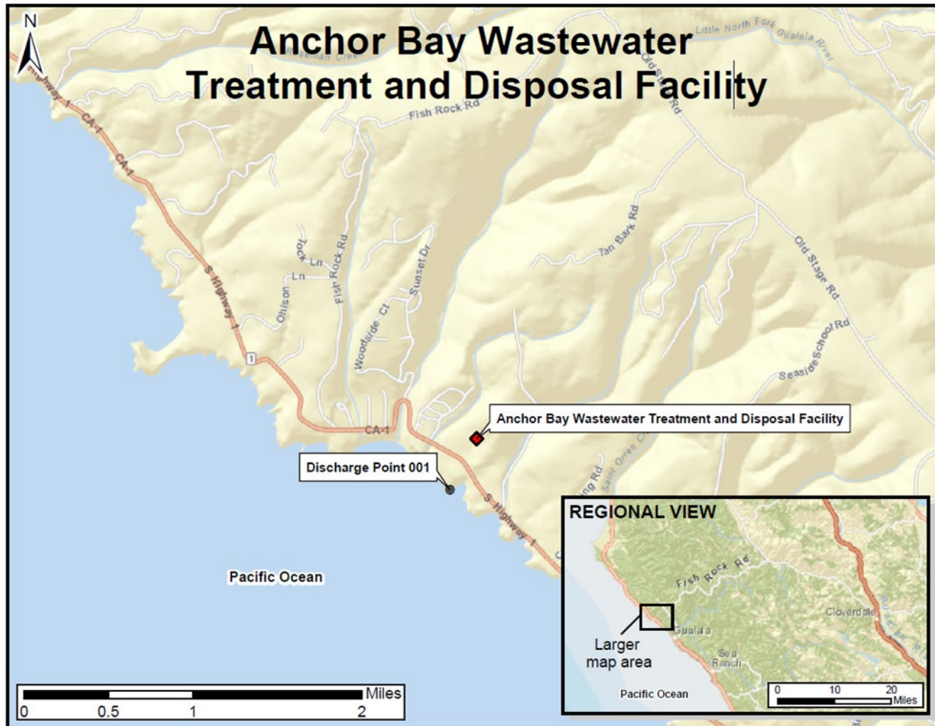
Figure B-1. Site Map